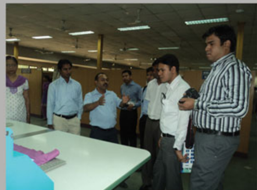
Study tour of Bangladesh delegates for MSME financing in India