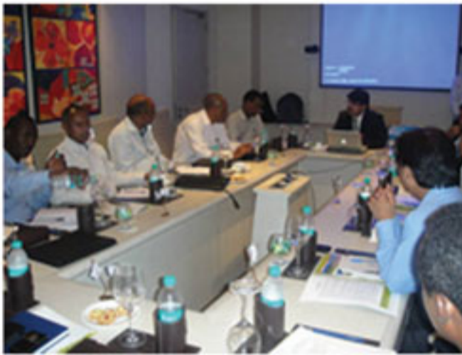
Interaction of Ethiopian delegates with Faridabad Foundry Cluster