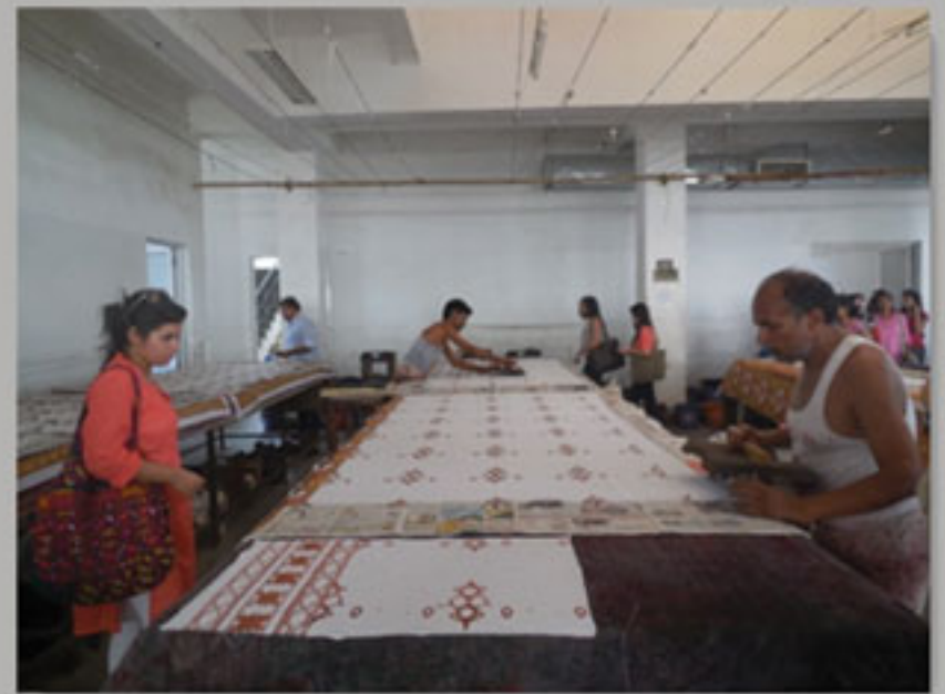
Study tour of women entrepreneurs to a Jaipur Textiles Park