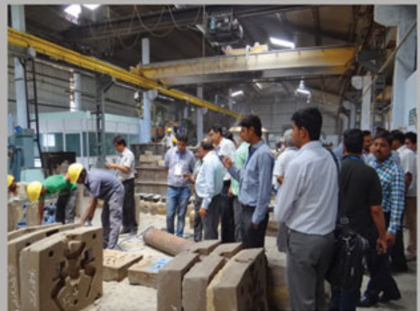
Exposure visit to Coimbatore foundry cluster