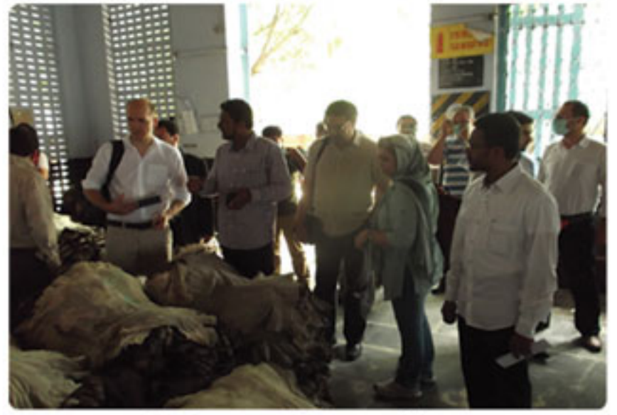
Study tour of Iranian delegates to Chennai Leather Cluster

It is a concentration of MSMEs and even large firms in a particular locality (few villages/city/district), producing same or similar products and facing common opportunities & threats. These units are called principal firms.