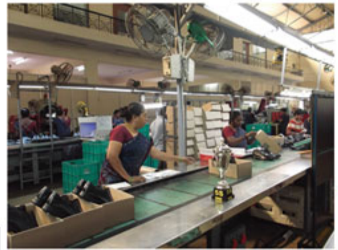
Exposure visit of Iranian delegates to Chennai Leather Cluster