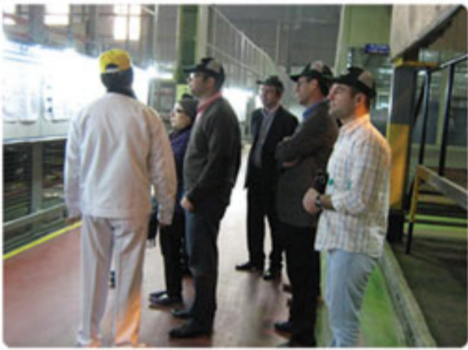
Exposure visit of International delegates to Gurgaon Automotive Cluster

FMC is a not-for-profit, non-government trust established in 2005 specializing in promoting MSMEs through cluster development approach by creating cutting edge methodologies and tools, providing appropriate linkages and creating enable institutions.