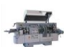
High-tech & Machinery