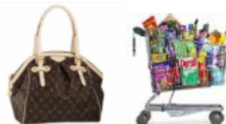
Luxury Goods & Retail