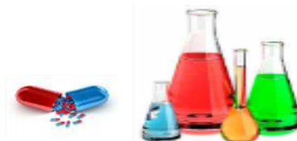
Pharma & Chemicals