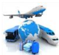
Transport & Logistics