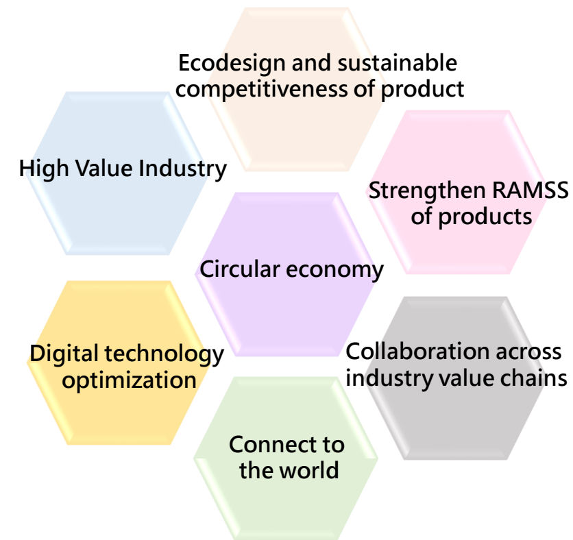
# RAMSS (Reliability, Availability, Maintainability, Safety, Security)