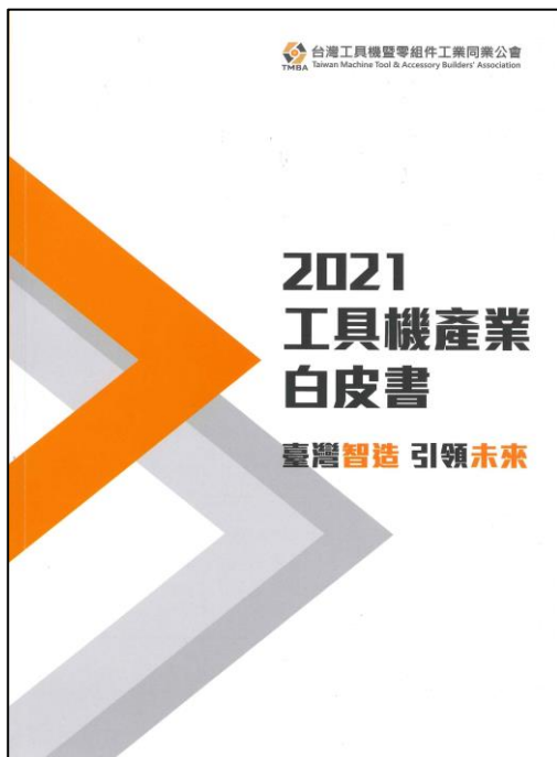
White Paper of 2021 Taiwan Machine Tool Industry