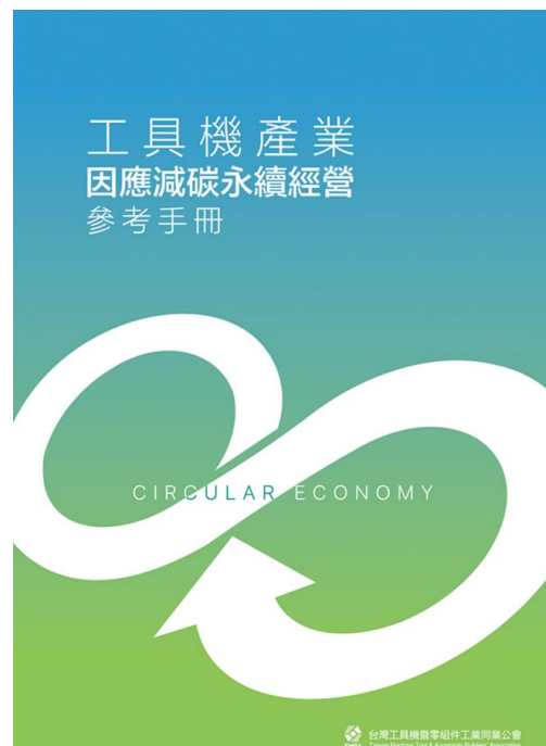
Handbook on Sustainable Operation of the Machine Tool Industry in Response to Carbon Reduction