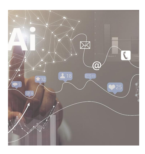
DIGITALISATION & AI