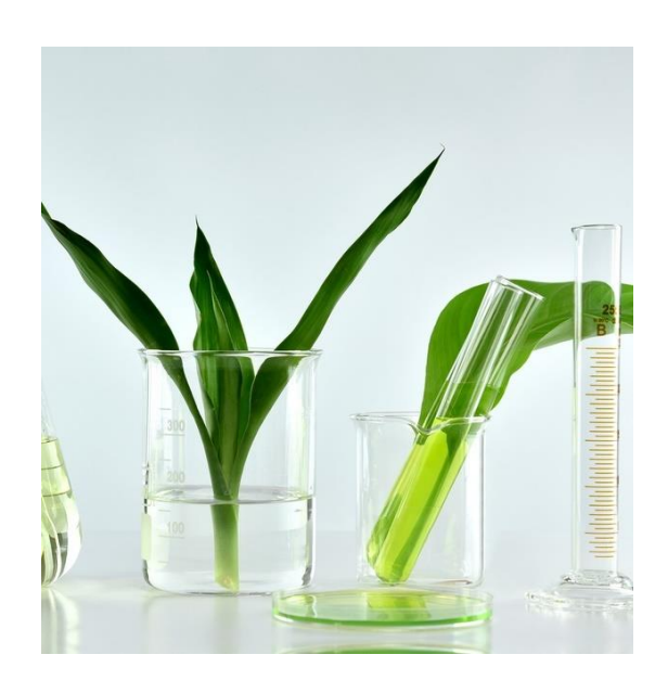
INNOVATION & TECHNOLOGY