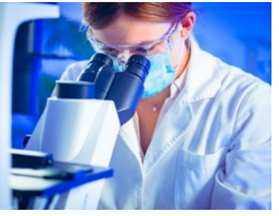
The European Parliament and European Council have agreed on the budget for Horizon Europe, the largest transnational programme ever supporting research and innovation.