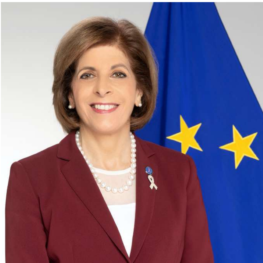
Mission letter of Stella Kiyriakides Commissioner for Health

“We need to make the most of the potential of e-health to provide high-quality healthcare and reduce inequalities. I want you to work on the creation of a European Health Data Space to promote health-data exchange and support research on new preventive strategies , as well as on treatments, medicines, medical devices and outcomes . As part of this, you should ensure citizens have control over their own personal data. ”